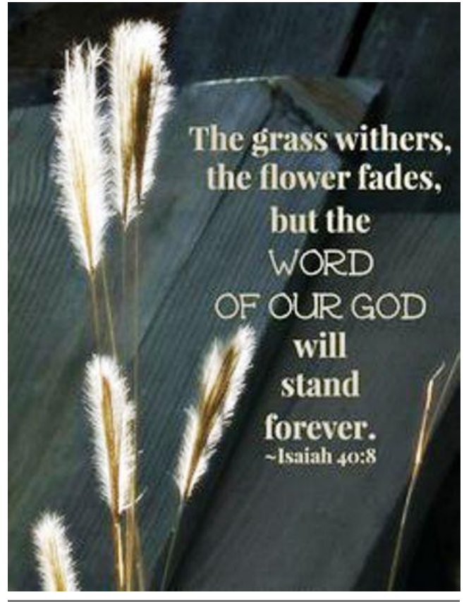
Gather, Grow, Give & Go with Us